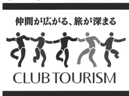
Figure 1. Logo for Club Tourism