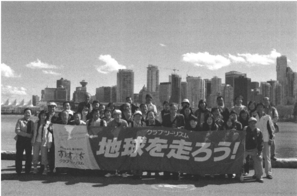
Figure 4. CTI’s Vancouver Marathon Tour Participants

together and observed at the end of April and beginning of May). The itinerary page presents “Recommended Points” about this marathon on the top of each tour page. The following points are made about this race: “Because this event is held during Golden Week, there are many Japanese runners in this race. The month of May is mid-Spring in Vancouver. It is the best season for running and for sightseeing. So, let’s go to Vancouver where the seafood is delicious!” Figure 4 shows a photo posted on CTI’s website of a recent Vancouver Marathon tour group.